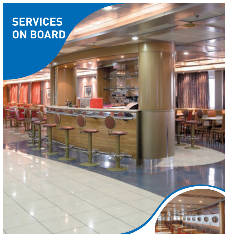
Restaurant, 2 Bars, Self-Service restaurant, Shops, Gambling room, Kids' Area.